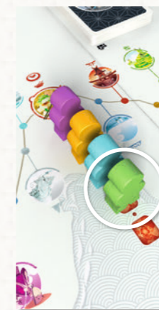
The green traveler will be the first one to leave the Inn.

The first traveler occupies the space nearest the road, and later travelers form a line after him.