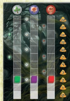
Character board (with markers in 'easy' starting position)

a red scoring marker on the Strength track