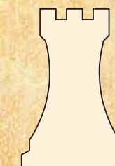
First Player marker

The starting player gets 4 Gold. The player to his or her left gets 5 Gold, and so on. Each player receives 1 more Gold than the player to his or her right until all players have received starting Gold.