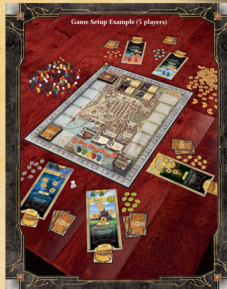
Game Setup Example (5 players)