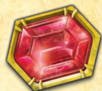
Victory Point (VP) token

As you complete Quests, you score Victory Points (VP) . Unpurchased Buildings accumulate VP over time, represented by die-cut tokens. As well, some Buildings and other game effects provide VP.